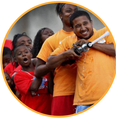
Camp Counselors $14/hr