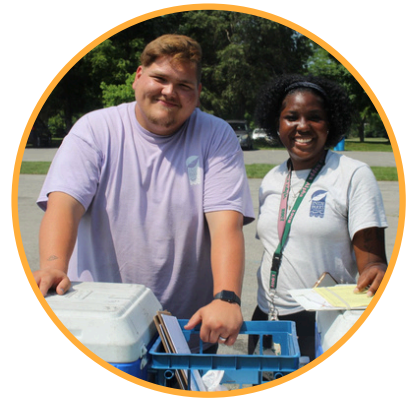
Food Program Coordinators $14/hr