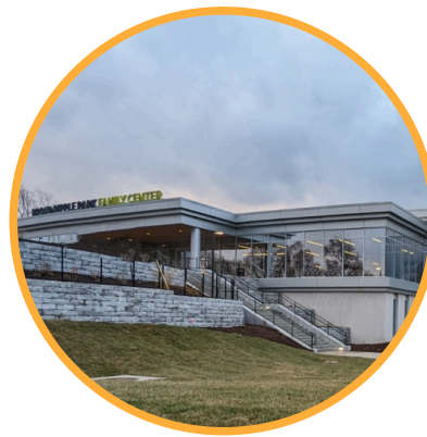
Facility Attendants $15/hr